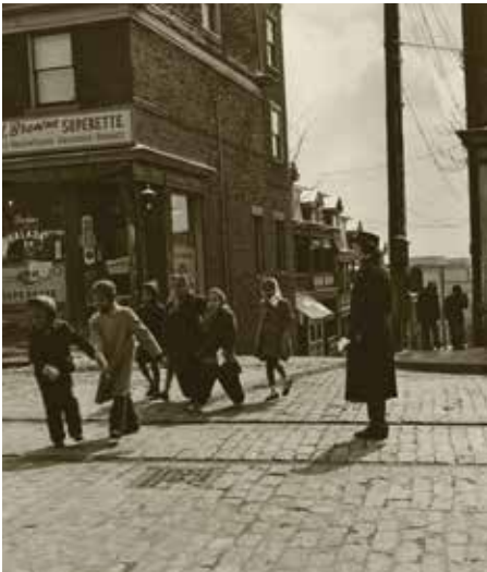
Policewoman directs traffic for school children at Watt Street and Bedford Avenue in 1951.