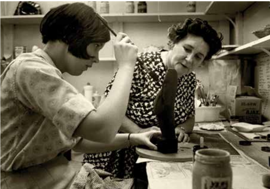
A 1960s-era photo of a young woman applying glaze to her clay sculpture while her instructor looks on at the Kingsley Association.