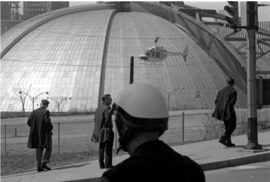
A helicopter makes its descent near the Civic Arena as it returns from monitoring the actions taking place three days after the assassination of Dr. Martin Luther King Jr.