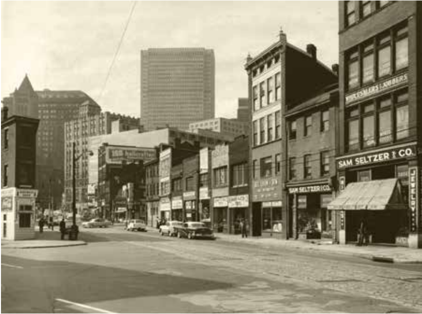
Looking west on Fifth Avenue at Diamond Street in 1956. The reconstruction of the Lower Hill began in 1955 with $17 million in federal grants. This project encompassed 100 acres, 1,300 buildings, 413 businesses, and 8,000 residents (a majority of them African-Americans), who were displaced in an attempt to extend the revitalization of the adjacent Golden Triangle.