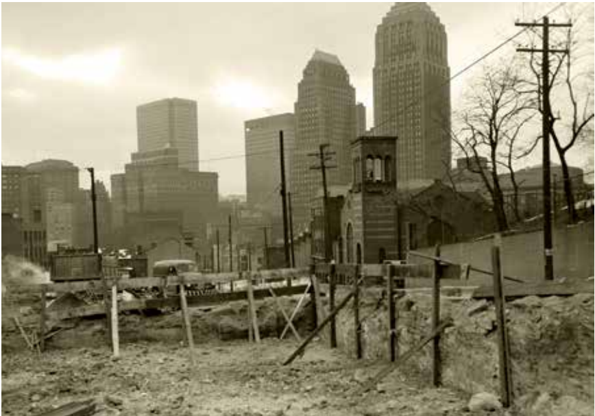
Buildings being torn down in the Lower Hill District as part of Pittsburgh's renaissance and urban renewal programs. The city skyline is visible in the background. January 2, 1957.