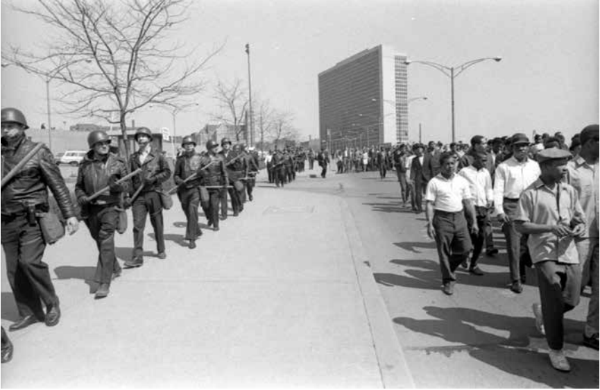
Marchers are flanked by police officers as they pass Washington Plaza on Centre Avenue, making their way to Downtown and the Point on April 7, 1968, during the march on the MLK Jr. National Day of Mourning.