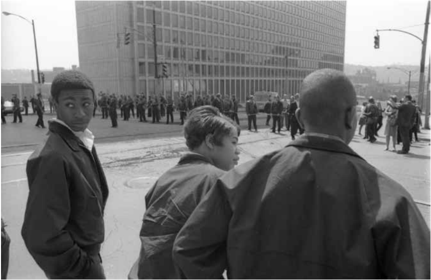
People stand near Washington Plaza watching the armed police officers form a barricade across Centre Avenue on April 7, 1968, during the march on the MLK Jr. National Day of Mourning.