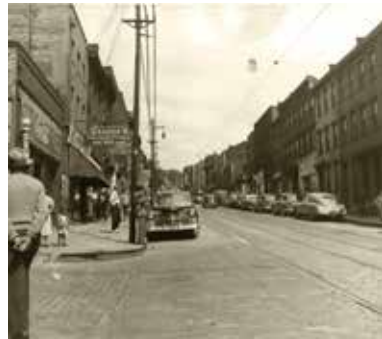
Looking east on Wylie Avenue from Logan Street in 1956. During the 20th century the older ethnic and Jewish population moved away and the Hill District became known as the Harlem of Pittsburgh, a place where the best jazz could be heard. Urban renewal in the 1950s removed virtually all of the Lower Hill.