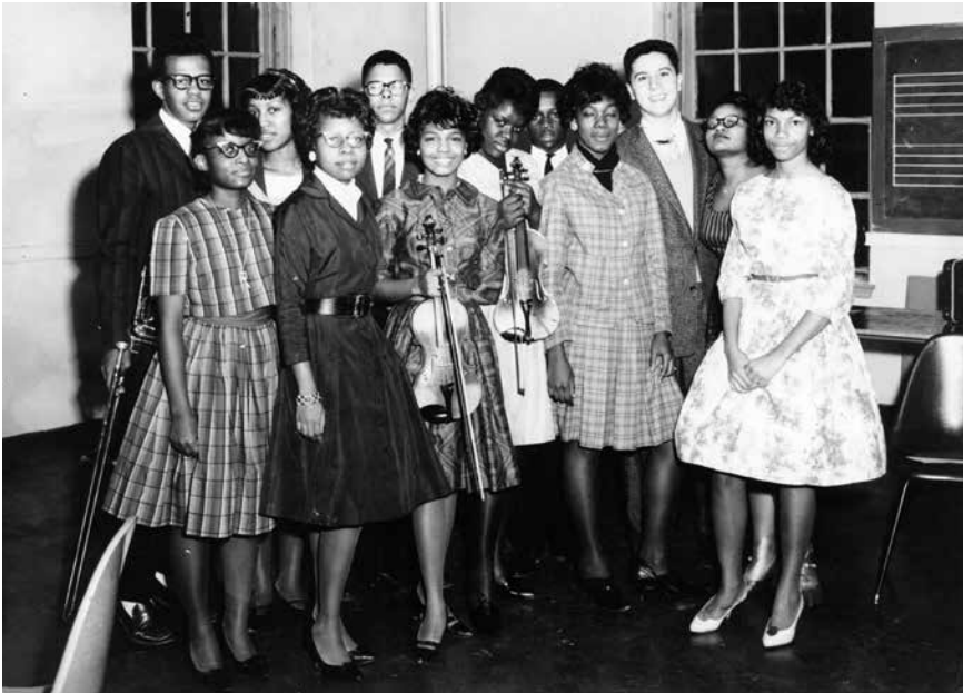
Members of a musical group sponsored by the Kingsley House, ca. 1950–60.