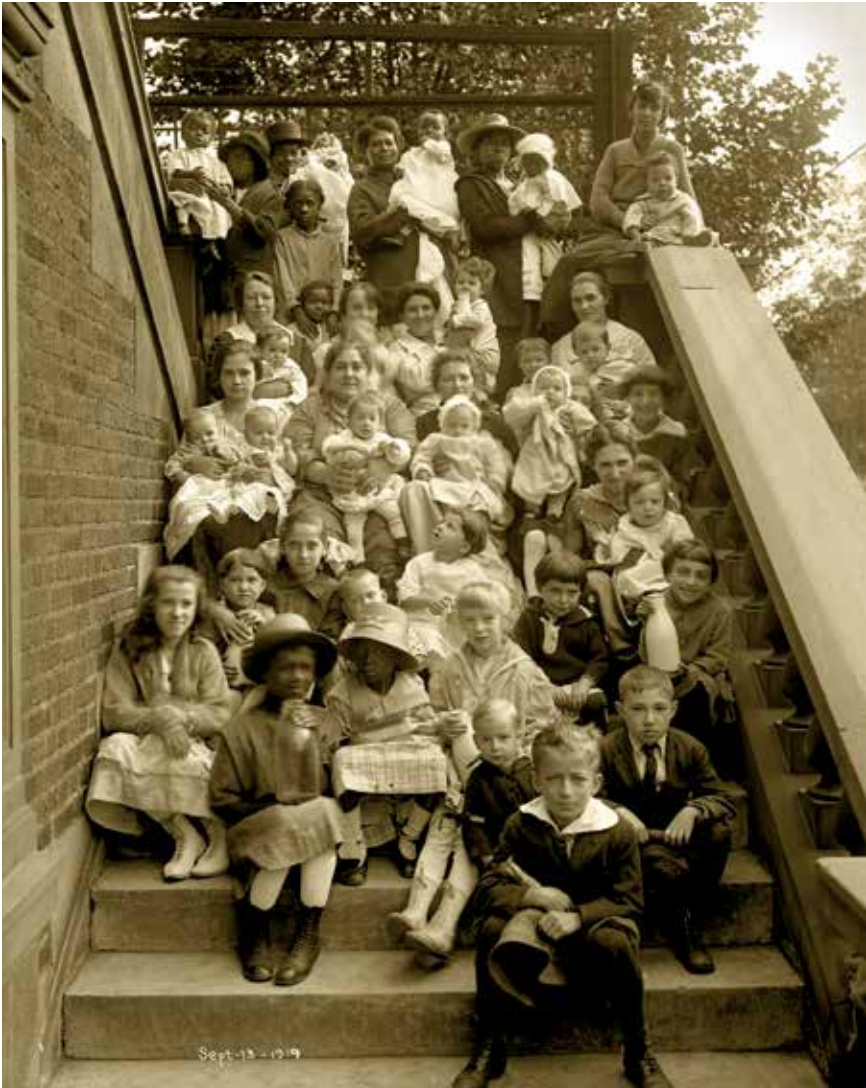
Women and children on the steps of the Irene Kaufmann Settlement in 1919.