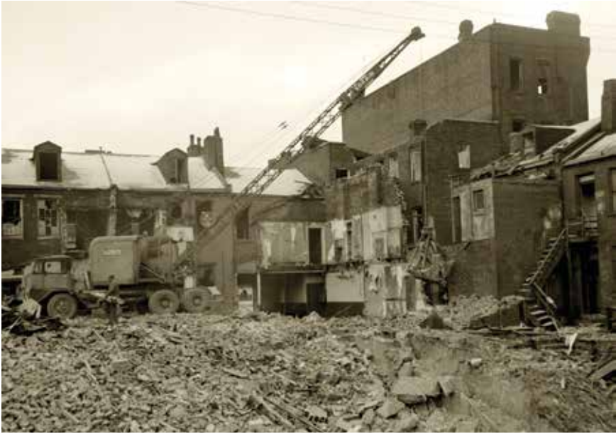
Buildings being razed in the Lower Hill District as part of Pittsburgh's renaissance and urban renewal programs, January 2, 1957.