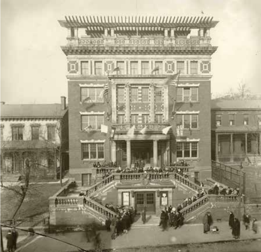
People gather in honor of the 23rd Anniversary of the Irene Kaufmann Settlement in January 1918. The building is decorated with flags of the allies.