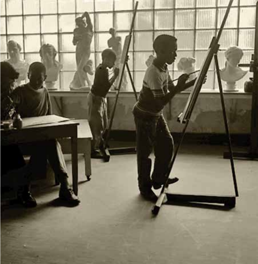
A children's class in painting, one of the many diversions offered at the Irene Kaufmann center, in a 1950 photo by Esther Bubley.