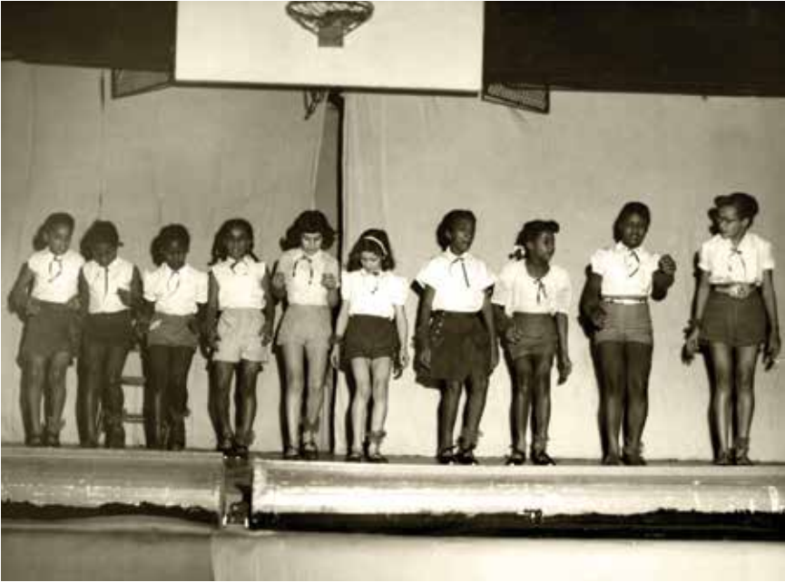
A 1960s-era photo of a line of girls practicing a dance routine beneath the basketball hoop at the Kingsley Association.